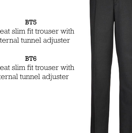
l pleat slim fit trouser with internal tunnel adjuster