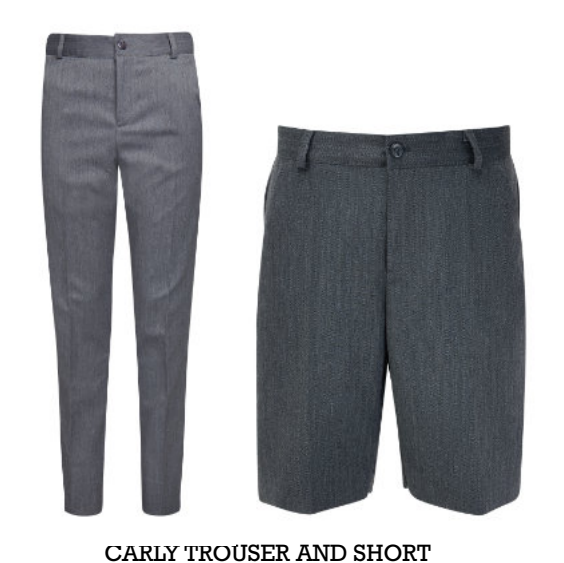
Lower rise trousers, tapered leg and wide waistband