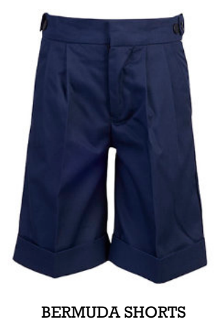
2 pleat longer leg school shorts with turn-up hem