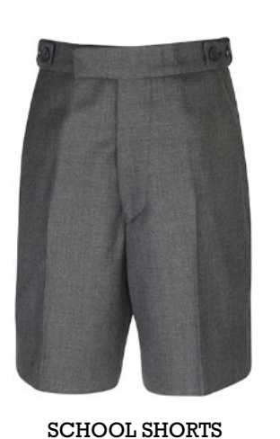
No pleat school shorts