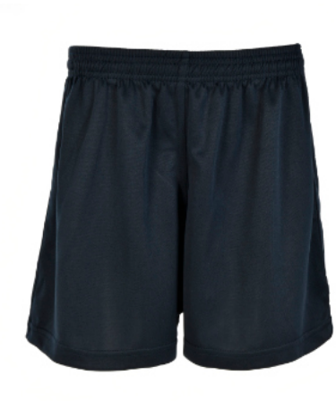
Football shorts made from polyester double interlock fabric