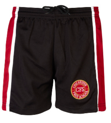
Sports shorts made from stretch peach polyester