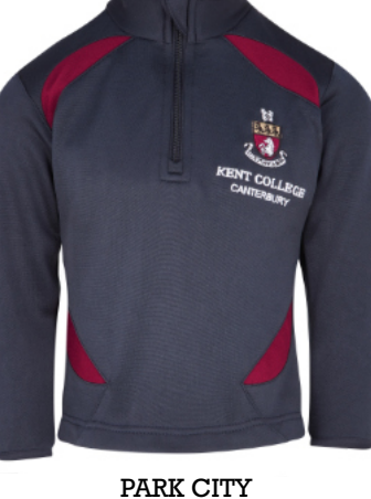
1/4 zip midlayer with contrast overlocking