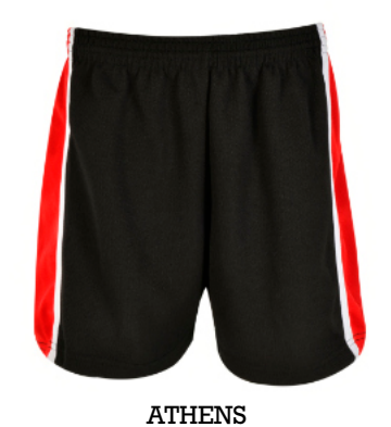
Sports shorts made from outdoor weight polyester popcorn fabric