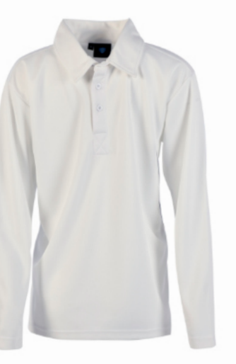
CRICKET SHIRT WITH SLEEVES

S/S cricket shirt polyester mini eyelet fabric