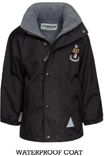
Fully tape seamed waterproof coat with fleece lining, can be reversed