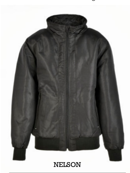
Shorter style showerproof coat, fleece lined, based on a sailing jacket