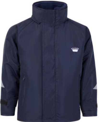
3 in 1 showerproof coat with detachable fleece gilet