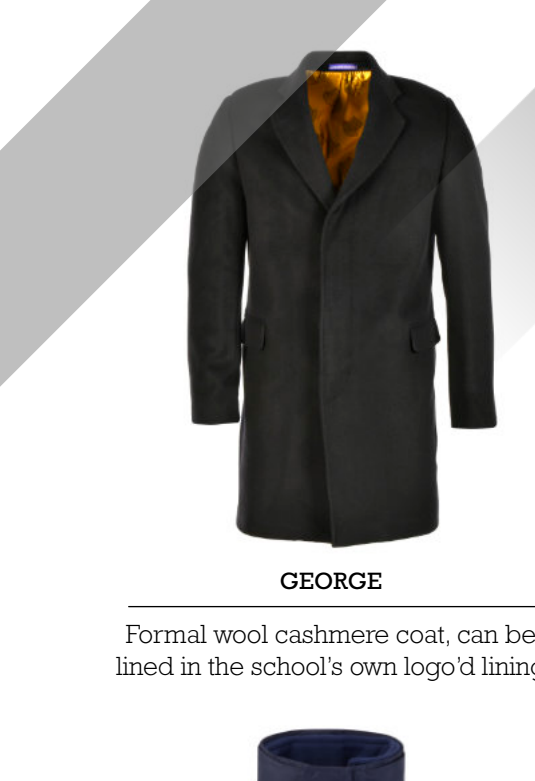
Formal wool cashmere coat, can be lined in the school's own logo'd lining