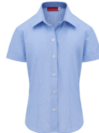
VALERIE L/S and VIOLET S/S

Fitted S/S blouse, button to neck, rounded collar