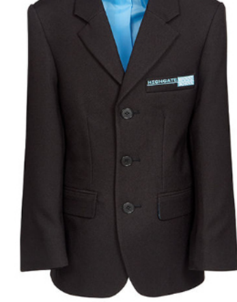
Fitted jacket, no front dart, welt top pocket and straight jet pockets