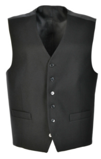
Single breasted waistcoat (double breasted also available)